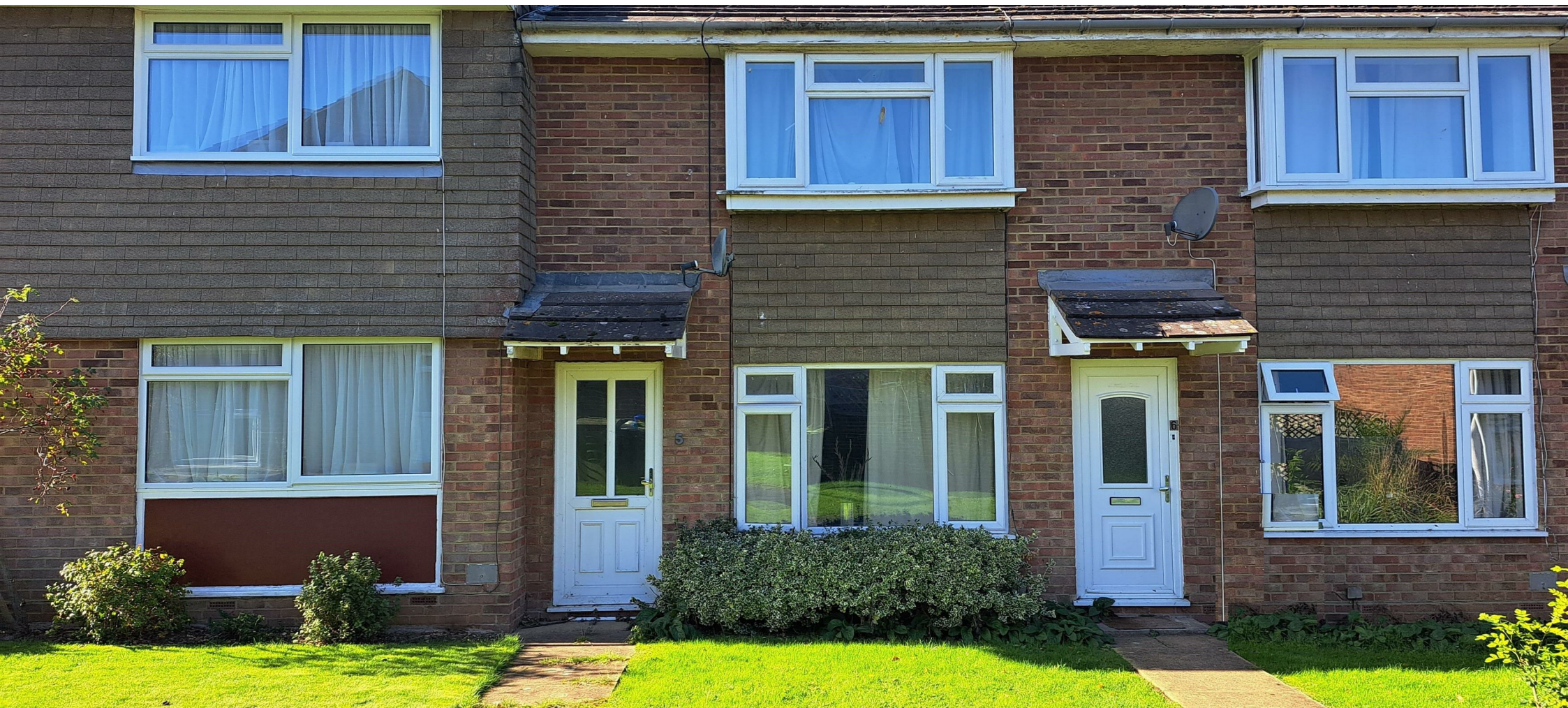
Buckhurst Close, Lewes