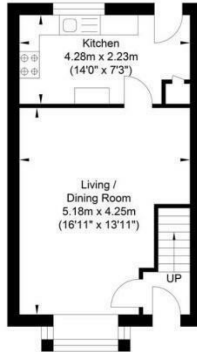
Ground Floor Approximate Floor Area 345.95 sq ft (32.14 sq m)